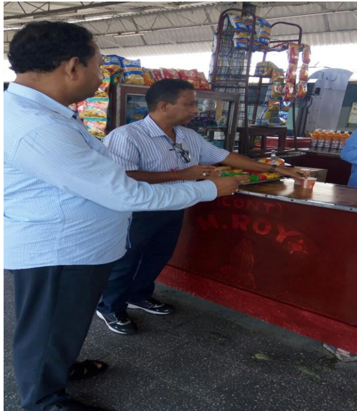
Checking of Vending Units of NCB Station by Sr.DMO/NCB & DCM/APDJ.