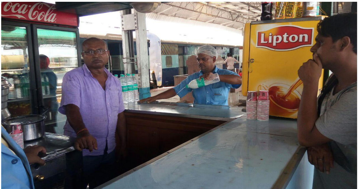
Inspection of Refreshment Room of NCB Station by Sr.DMO/NCB & DCM/APDJ.